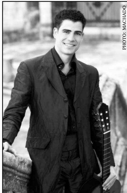
Pablo Sáinz Villegas.

You have also a live recording of the Aranjuez Concerto with the Orquesta de Radio Televisión Española.